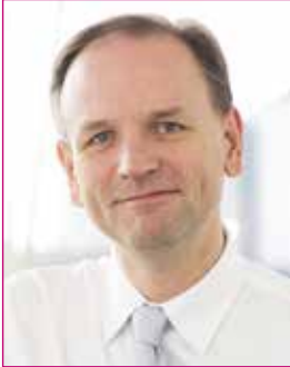
Simon Stevens, Chief Executive, NHS England

If we get this right, people's lives will be transformed and we will also achieve much better use of public money. However we know that there are many problems to overcome, including structural, financial and cultural barriers that get in the way of change happening at scale. We also know that the NHS and local authorities are stretched, and money is tight. We are committed to working together in a way that supports innovation and experimentation, then scaled to ensure wide input and improvement.